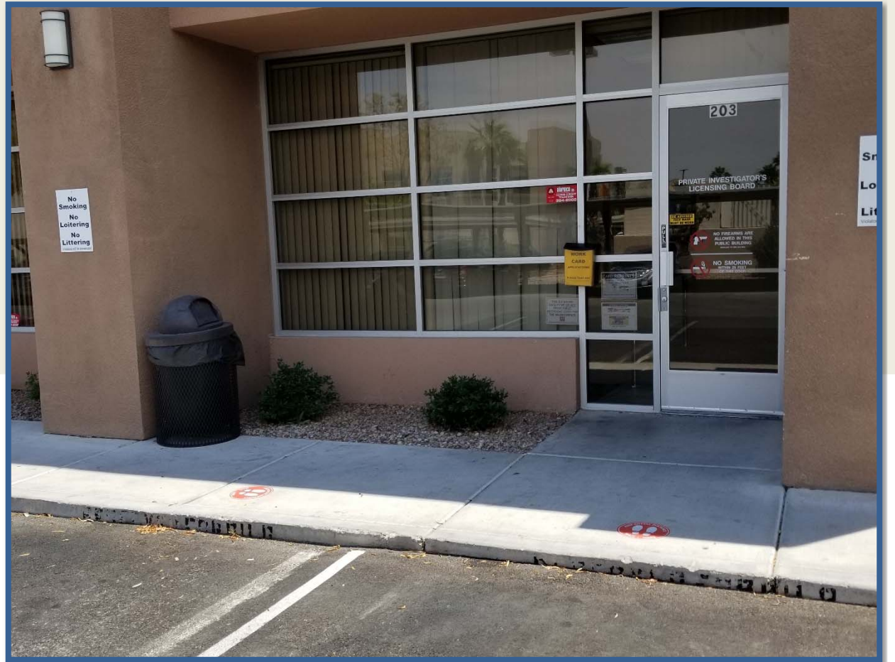
LAS VEGAS OFFICE FRONT: Social distancing floor decals ensuring 6' feet distance in line.